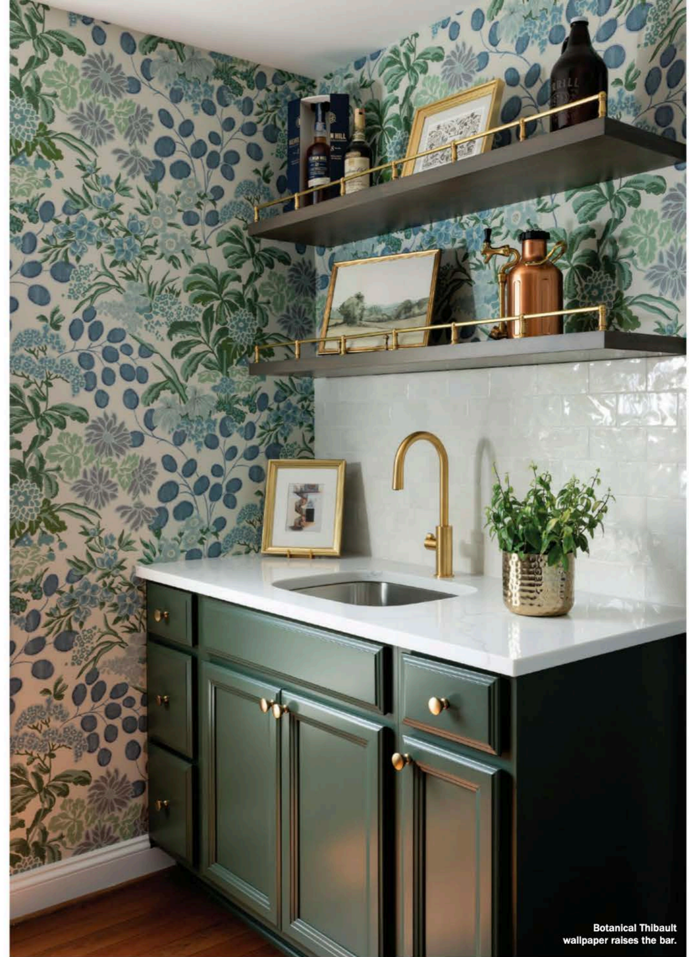
Botanical Thibault wallpaper raises the bar.