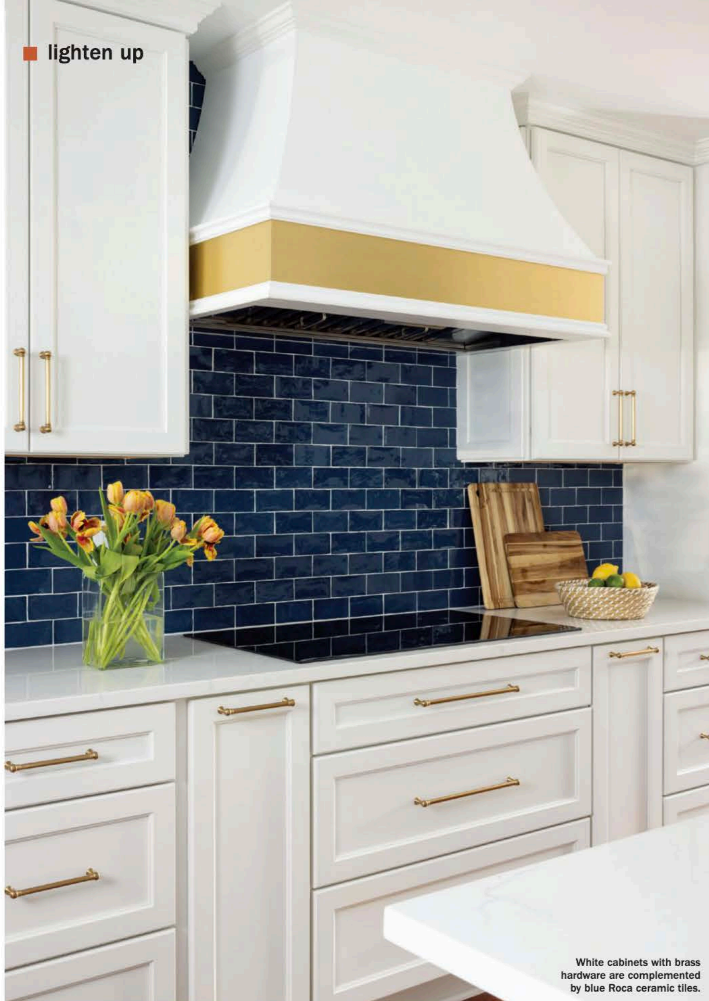
White cabinets with brass hardware are complemented by blue Roca ceramic tiles.