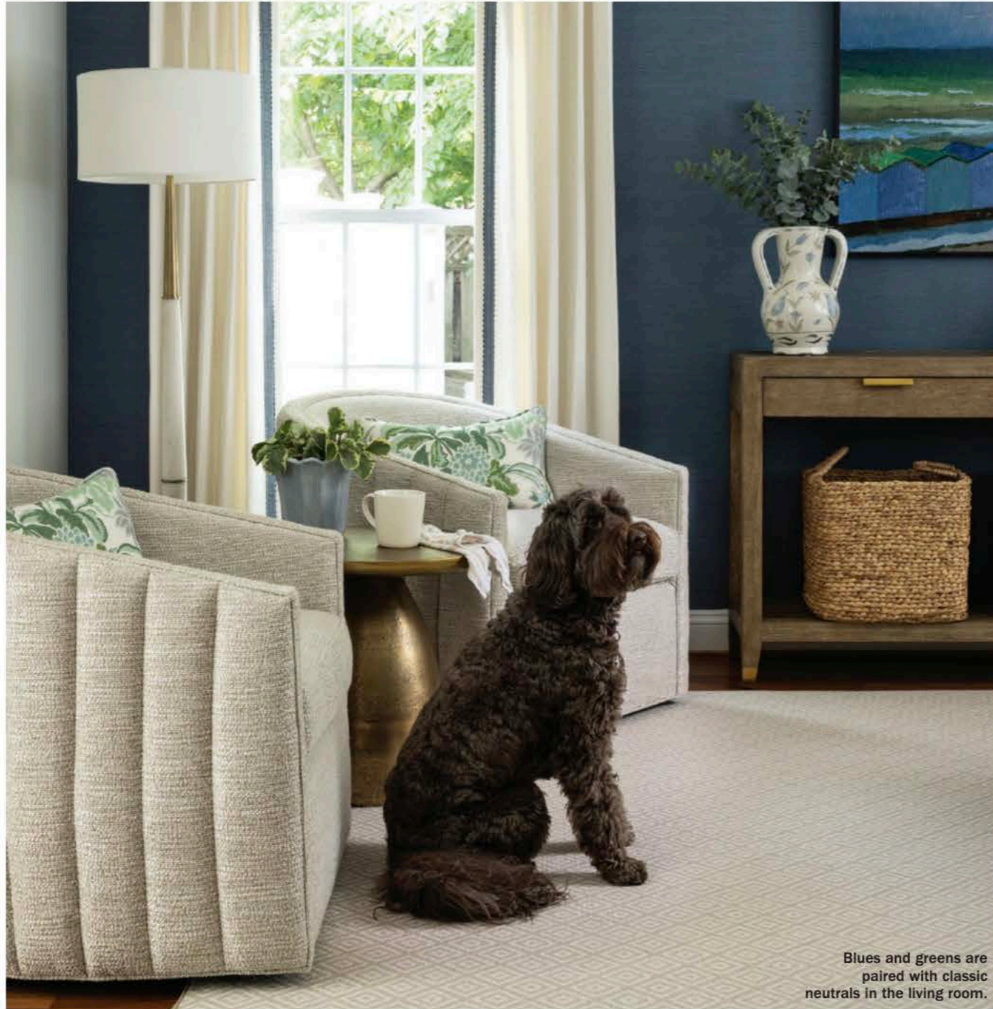
Blues and greens are paired with classic neutrals in the living room.

made integrating sections of old and new flooring rather tricky.