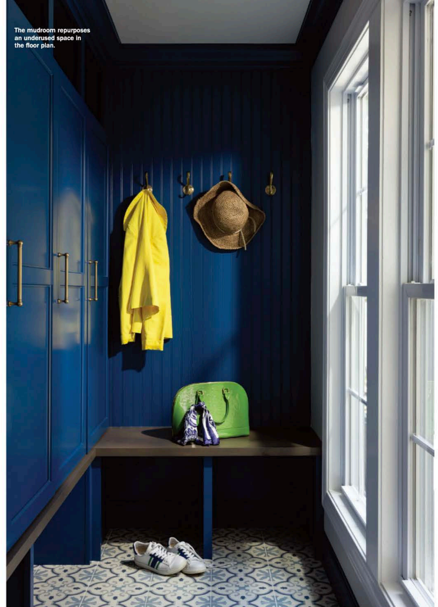
The mudroom repurposes an underused space in the floor plan.

Nigel F. Maynard is editor of the new magazine Design Vibes. Follow him on Instagram @products_hound and @designvibesmag.