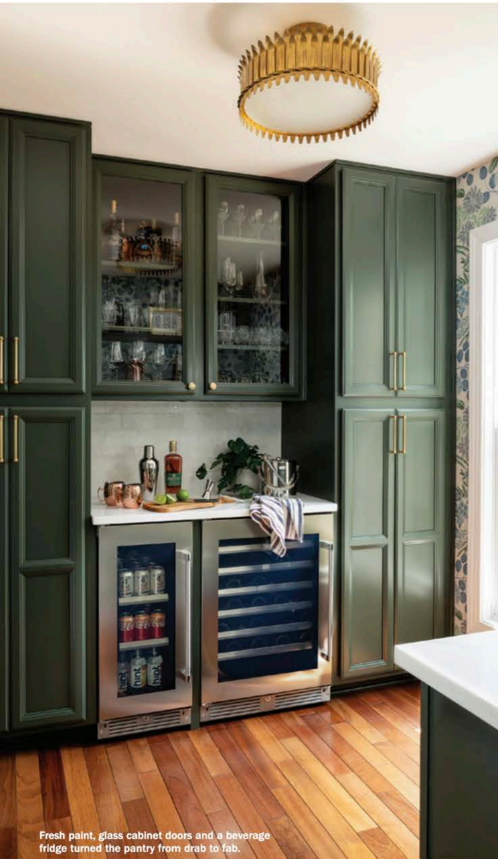
Fresh paint, glass cabinet doors and a beverage fridge turned the pantry from drab to fab.

two walls. In the adjoining pantry, Sutter painted the existing cabinets hunter green and introduced a complementary floral wallpaper to create a “dark moody” vibe.